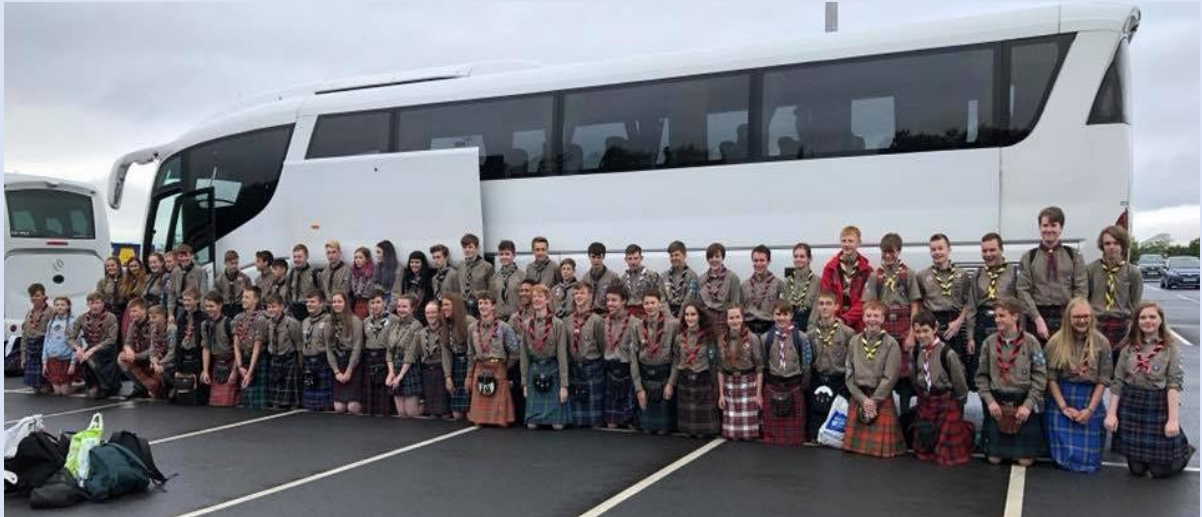
Explorers off to Blair Atholl Jamborette

Explorers: Within South East Region, we were very lucky to have had many young people undertaking their Explorer Belts. The international theme continued, for example with attendance at a Danish Jamboree, and a camp in Italy which featured a trip up Monte Bianco by cable car, white water rafting through glacial run off rivers and a whole variety of other adventurous activities. Our leaders are often-unsung heroes who deserve great credit and recognition for their commitment and energy providing such a fantastic range of opportunities to Explorer Scouts in our Region.