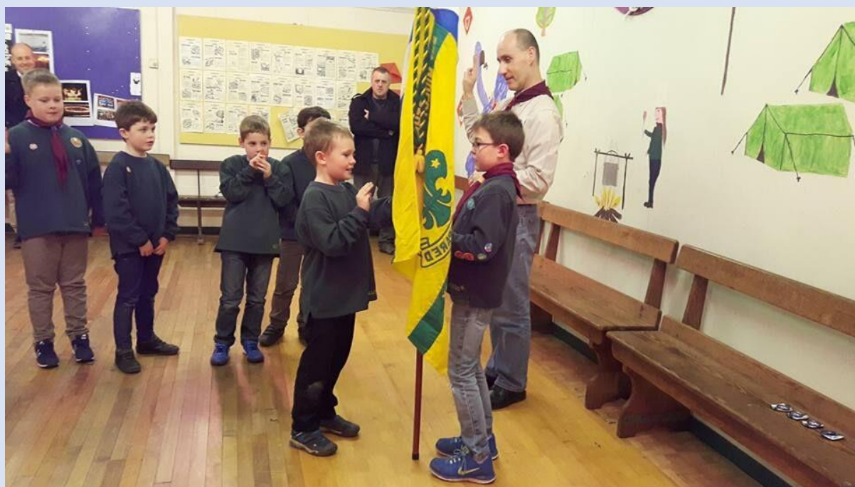
Investiture at a Cub meeting

Recruitment, training and appointment of the Regional Executive Committee members: The Executive Committee members are all volunteers who are nominated from local Scout Groups or by existing members. Each member is required to go through a recruitment process that is operated by the Scout Association and involves the completion of the Protection of Vulnerable Group Scheme (PVG) check due to working with children. Part of the appointment process includes full induction training to Scouting.