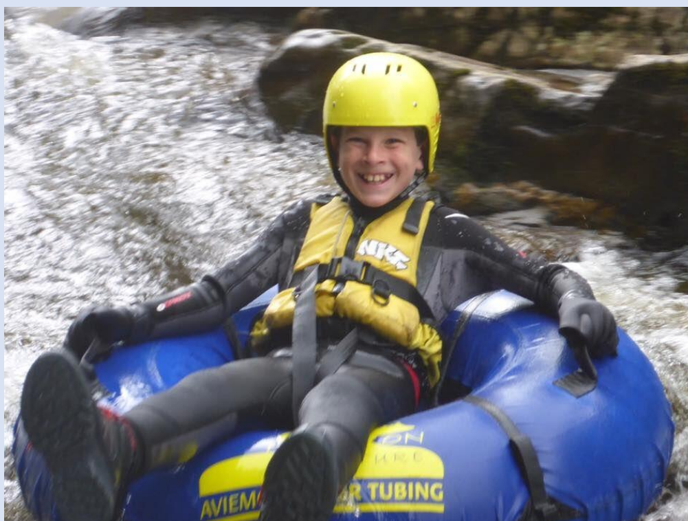
Scouting in action!

Please note: All photos are taken from our District Annual Reports or Scout websites.