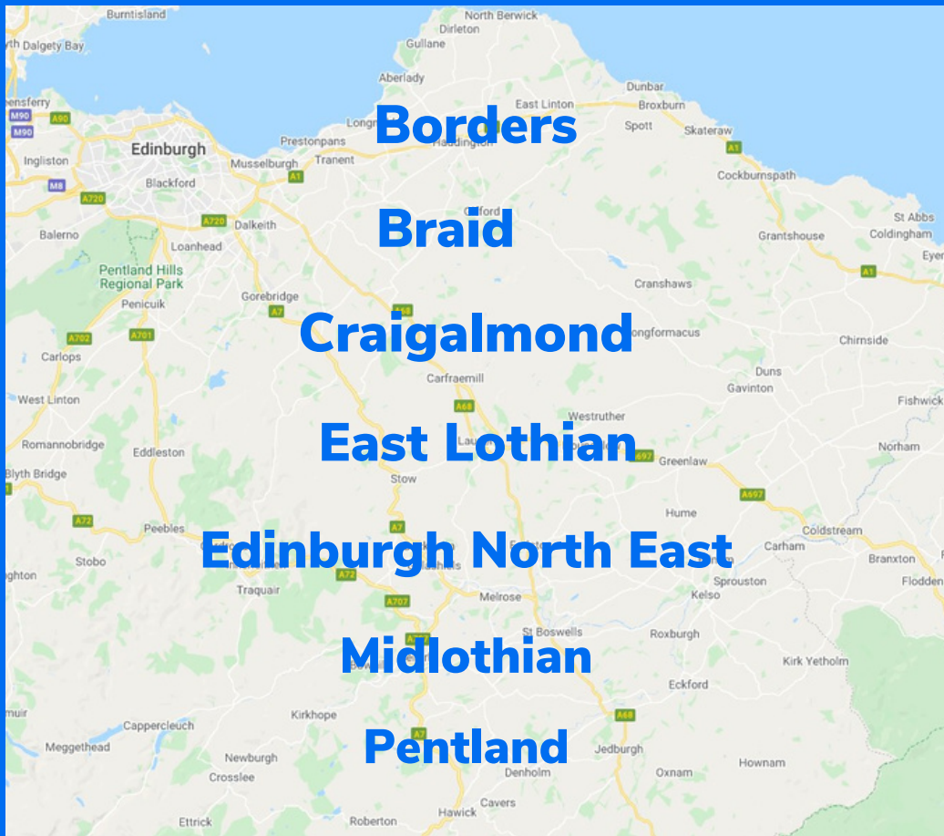
Figure: Our 7 Districts of South East Scotland Scouts

Charity Registration Number: SC010563 Copyright South East Scotland Scouts 2022